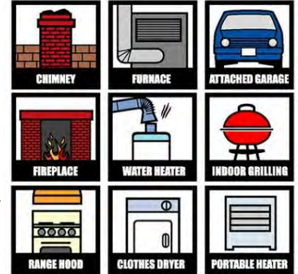
POTENTIAL SOURCES OF CARBON MONOXIDE IN THE HOME

According to the National Fire Protection Association (NFPA), CO poisoning causes 500 deaths and sends 20,000 people to the hospital for treatment each year. People with certain medical conditions, such as asthma, emphysema, cardiac problems, the elderly, infants and pregnant women are especially at risk. CO poisoning often goes misdiagnosed as the symptoms mimic other illnesses. CO poisoning occurs when CO quickly displaces the oxygen on red blood cells and prevents normal oxygenation in the body. Symptoms can include dizziness, shortness of breath, nausea, headaches and a blushed appearance to the skin. High concentration of CO can cause harmful or even fatal effects.