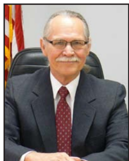
Mayor John Shine

The City Council is preparing for its annual strategic planning meeting and we will discuss the level of services being provided and what our priorities will be for next year's budget process. The cost of government services can be broken down into three parts; infrastructure, equipment and materials for operations and personnel. Infrastructure is a huge upfront cost and once it is built it's relatively affordable to maintain, but historically it has been ignored due to higher priorities and an effort to reduce taxes. The materials and supplies that the city buys each year to deliver services only make up about 20% of its annual operating budget. The City's largest recurring expense is for personnel, which makes up the other 80% of the annual budget. City employees work day in and day out to provide the level of service that we enjoy for police protection, fire protection, roads, parks, irrigation, fresh drinking water, clean sewage treatment, library and other community services. These are labor intensive activities that create the high operations and maintenance costs that define the nature of government services.