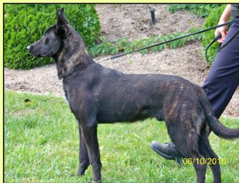
Kenzo is Belgian Malinois/Dutch Shepherd cross