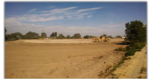
After (July 22)