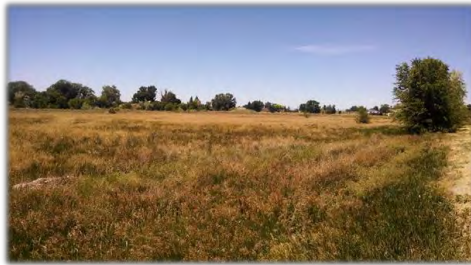
Before (June 30)

Construction of the Emergency Storage Lagoon started on June 30 th . Western Construction has "cleared" the area where the lagoon will be located and has started digging the shape of the lagoon. They are doing a wonderful job controlling the dust created by the activity and will continue to do so for the duration of the project. If you are traveling on North 100 West Road between now and February 2015, please watch for slow traffic and heavy equipment. If you have any questions or concerns you may contact the Wastewater Department at 324-7122. Until next time, have a wonderful August!