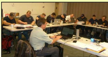
Several public safety participated in a locally taught 100 hour course on hazardous materials

The month of March was a month full of educational enrichment for the Fire Department and several members of our Police and Water Works Departments. These members participated in a Hazardous Materials Technician Training. Other attendees included firefighters from the Idaho National Laboratory and the City of Pocatello Fire Department.