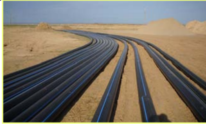
Water pipes at the Jerome Butte, now underground

The significant growth and economic development in the south and west area of Jerome